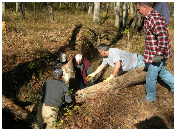
Interns and volunteers help park staff with stream restoration.

There are several exciting internships being offered at Huntley Meadows and Historic Huntley this summer, sponsored directly by Friends of Huntley Meadows Park and Friends of Historic Huntley: